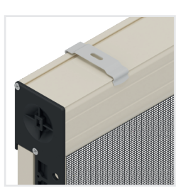
Clips Upon Request